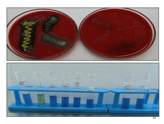
Fig. 3. Screening of EPS and Organic acid Production.

Out of seven tested fungi, isolates Aspergillus niger , Alternaria sp and Penicillium sp from sample 2 and 3 only show positive results on EPS production (Cuezva, 2012). Likewise the ability of organic acid using bromophenol blue indicates Cladosporium sp positive on organic acid production. Previously it was reported that application of a mixture of organic acids significantly promoted growth of pathogenic fungi, and increased the expression of chemotaxis-related gene (cheA) and biofilm formation (Cuzman et al. , 2011).