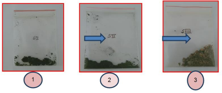
Fig. 1. Biodeteriorated sample from Perumal temple.

1. Sample was collected in Pundarikakshan Perumal temple at Thiruvellarai at various at various sites; 2. Site II; 3. Site III